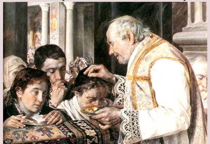
An 1881 Polish painting of a priest sprinkling ashes on the heads of worshippers.